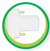
G24/G23 (2pins 4pins)